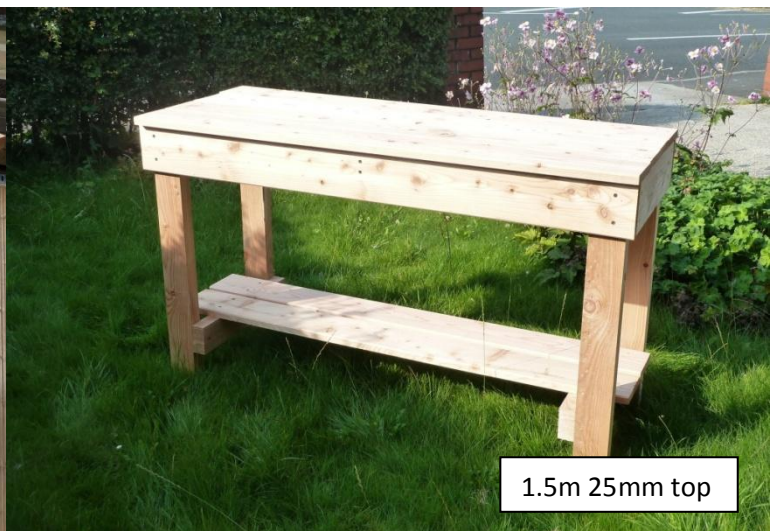
1.5m 25mm top