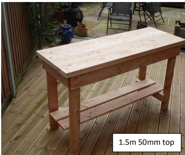
1.5m 50mm top

The workbench is complete. We hope you enjoy using it.